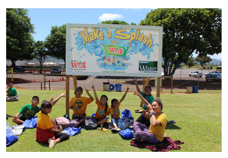
Photo: Kekaha Elementary School students at the Department of Water's Make a Splash water education festival (2019).

The State requires us to monitor for certain contaminants less than once per year because the concentrations of these contaminants are not expected to vary from year to year. Thus, some of the data, though representative of the water quality, is more than one year old.